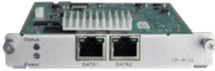
CP2-IP-02 Multi-channel IP Module