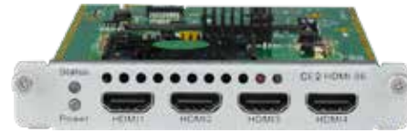
CE2-HDMI-06 Professional HDMI Encoder Module