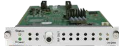
CM2-QAMB-R01/R01A: QAMB Modulation Module