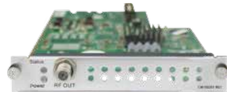
CM2-ISDB-T-R01/R01A: ISDB-T Modulation Module