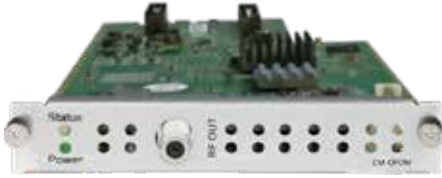
CM2-OFDM-R01/R01A: OFDM Modulation Module