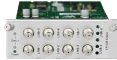
CR2-DVBS2FTA-01A DVB-S/S2/S2X FTA Receiver Module