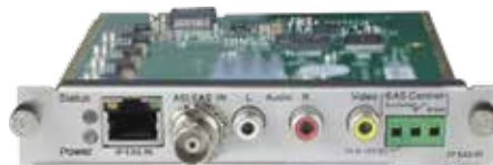
CP2-EAS-00: EAS Processing Module