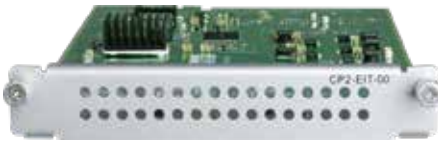
CP2-EIT-00 Processing Module