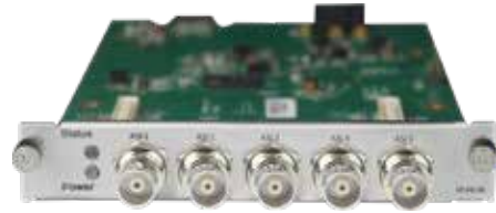
CP2-ASI-00: 5-Port ASI Module