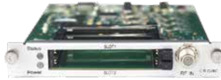
CR2-DVBC-00: DVB-C/DTMB Receiver Module