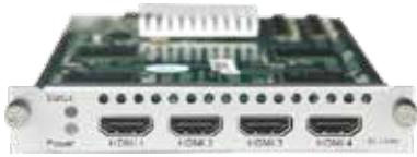
CE2-HDMI-R01: Commercial HDMI Encoder Module