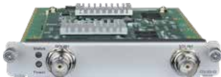
CE2-SDI-01: SDI Encoder Module