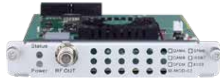
CM2-QAMA-03 QAM Modulation Module