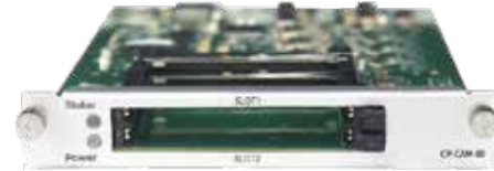
CP2-CAM-00: CI Scrambler/Descrambler module