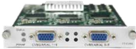
CE2-CVBS-R01: Commercial CVBS Encoder Module