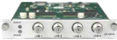
CR2-DVBS2FTA-01: DVB-S/S2/S2X FTA Receiver Module