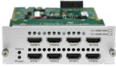
CE2-HDMI-05A: HEVC HDMI Encoder Module (8-CH)