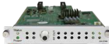
CM2-DTMB-R01/R01A: DTMB Modulation Module