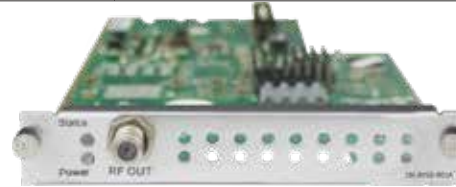
CM2-8VSB-R01/R01A: 8VSB Modulation Module