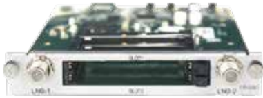
CR2-DVBS2CI-01: DVB-S/S2/S2X with CI Receiver Module