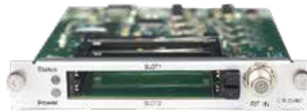
CR2-DVBC-01: DVBC Annex B/ISDB-T Receiver Module