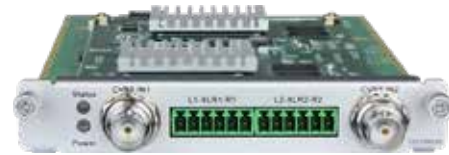
CE2-CVBS-03 CVBS Encoder Module