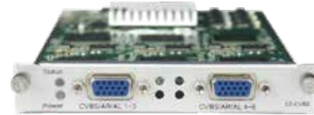
CE2-CVBS-00: Professional CVBS Encoder Module

Notes: CE2-HDMI-06 will forcefully output 4 HD programs with same video resolution which follows the largest video resolution among the input source and SD encoding is not supported yet.