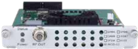
CM2-DTMB-03 DTMB Modulation Module