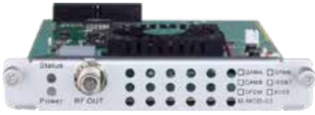
CM2-OFDM-03 OFDM Modulation Module