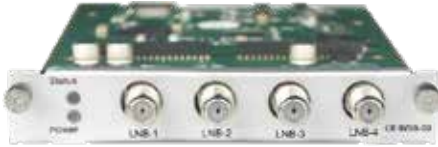
CR2-8VSB-00: 8VSB Receiver Module