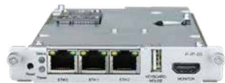
CP2-IP-00: Multi-protocol IP Module