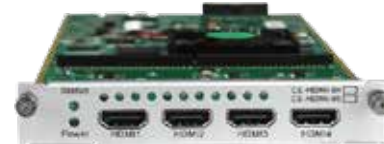
CE2-HDMI-R05 HEVC HDMI Encoder Module (4-CH)