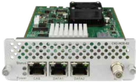
CM2-QAMA-02/02A IQAM Module