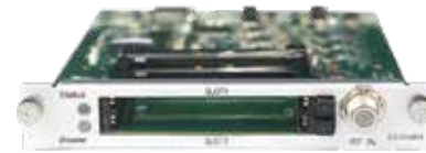
CR2-DVBT2CI-00: DVB-T/T2 with CI Receiver Module