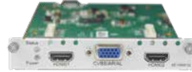
CE2-HDMI-02C: HDMI Encoder Module with YPbPr/CC