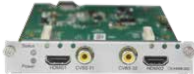
CE2-HDMI-02: HDMI Encoder Module with CC