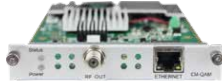
CM2-QAMA/B-R00: QAM Modulation Module