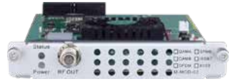
CM2-ISDBT-03 ISDBT Modulation Module